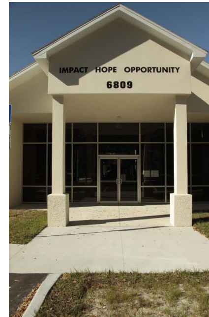
Exterior Entrance & Porte Cochere (An exterior shelter for those entering and exiting the building)

The new Boys & Girls Club of Riverview has opened and is now servicing the Riverview community under the auspices of The Boys & Girls Clubs of Tampa Bay, Inc. We are happy to report that the club is at capacity and has a long waiting list. We would like to give a special shout out to our subcontractors on this project who worked very hard to keep a tight schedule to accommodate the projected opening date of the facility. Those include Site & Civil, Sunrise Landscape, George Lenz Construction, Home Pride Cabinets, Polar Foam, Westfall Construction, Metropolitan Glass, S & L Stucco, Floors, Inc., Acousti Engineering, Southern Equipment Corp., CGM Services and All Phase Electric.