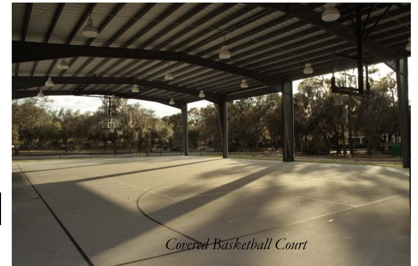
Covered Basketball Court

The new Boys & Girls Club of Riverview has opened and is now servicing the Riverview community under the auspices of The Boys & Girls Clubs of Tampa Bay, Inc. We are happy to report that the club is at capacity and has a long waiting list. We would like to give a special shout out to our subcontractors on this project who worked very hard to keep a tight schedule to accommodate the projected opening date of the facility. Those include Site & Civil, Sunrise Landscape, George Lenz Construction, Home Pride Cabinets, Polar Foam, Westfall Construction, Metropolitan Glass, S & L Stucco, Floors, Inc., Acousti Engineering, Southern Equipment Corp., CGM Services and All Phase Electric.