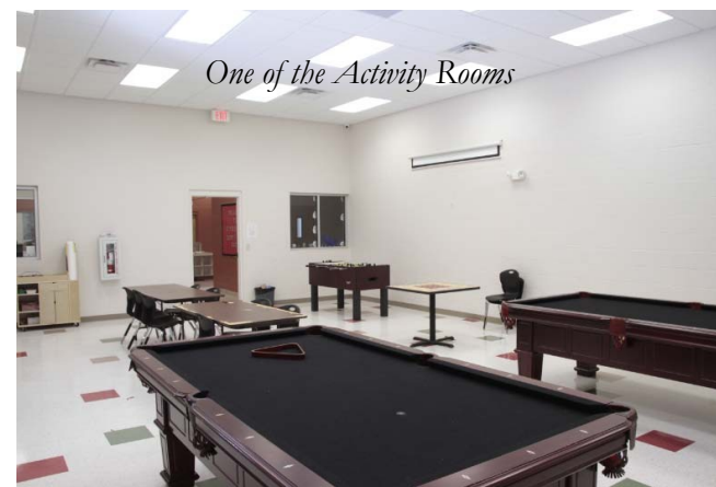
One of the Activity Rooms