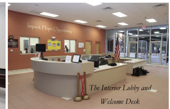
The Interior Lobby and Welcome Desk